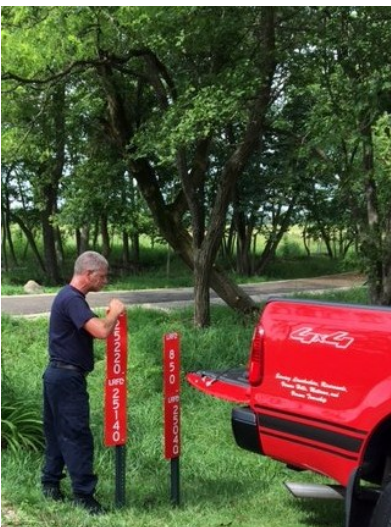
Street address signs being installed by the Lincolnshire-Riverwoods Fire Protection District.

Thanks primarily to the persistent efforts of Trustee Jan Pink, these same red markers are being installed for Mettawa residents living south of Route 60 within the Lincolnshire-Riverwoods Fire Protection District (LRFP).